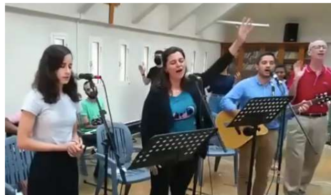
The worship team from Lebanon lead the group in praise & worship in multiple languages